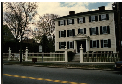
Blanchard House, home of the Andover Historical Society.

The Andover Historical Society is an important educational and cultural resource for the town of Andover, Massachusetts and the greater Merrimack Valley. Its mission is to collect, preserve, exhibit, and interpret documents and artifacts reflecting the life of Andover and its people from the 17th Century to the present. The Society provides a wide range of educational programs and services for individuals and groups of all ages in order to encourage a greater appreciation for and understanding of local history and related preservation issues.